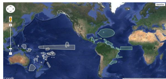
Figure 2. Existing EBSAs recognized by the CBD

In 2008, the COP approved criteria to be used in the identification of ecologically and biologically significant marine areas (EBSAs). These areas are particularly important to the health of the ocean and may require special conservation and/or management attention, which can be achieved through environmental impact assessments (EIAs), Marine Protected Areas (MPAs), and a variety of other